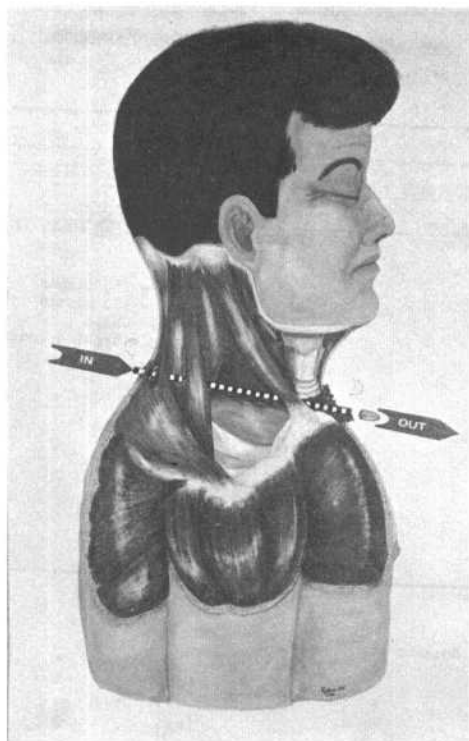
COMMISSION EXHIBIT 385