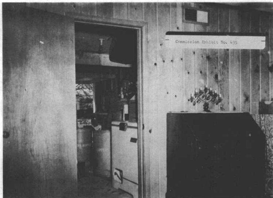
5. LOOKING THROUGH DOOR LEADING TO GARAGE FROM KITCHEN.