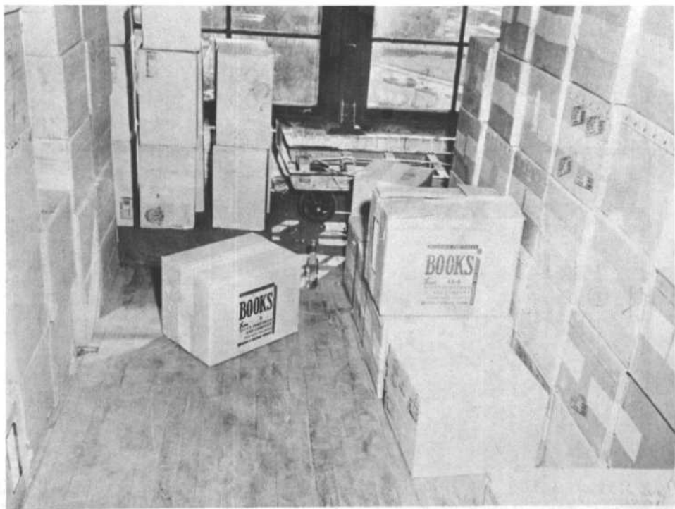
, COMMISSION EXHIBIT 484