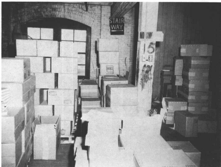
COMMISSION EXHIBIT 719