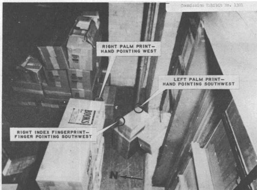
SOUTHEAST CORNER OF SIXTH FLOOR SHOWING ARRANGEMENT OF CARTONS SHORTLY AFTER SHOTS WERE FIRED.