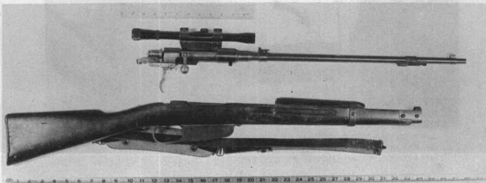
COMMISSION EXHIBIT No. 1304—Continued