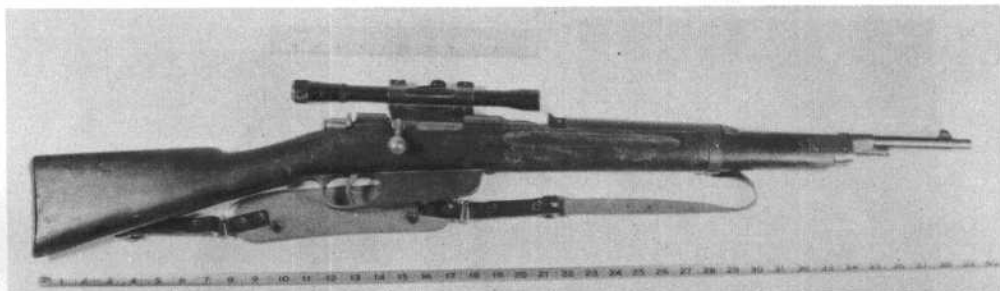
COMMISSION EXHIBIT No. 1303