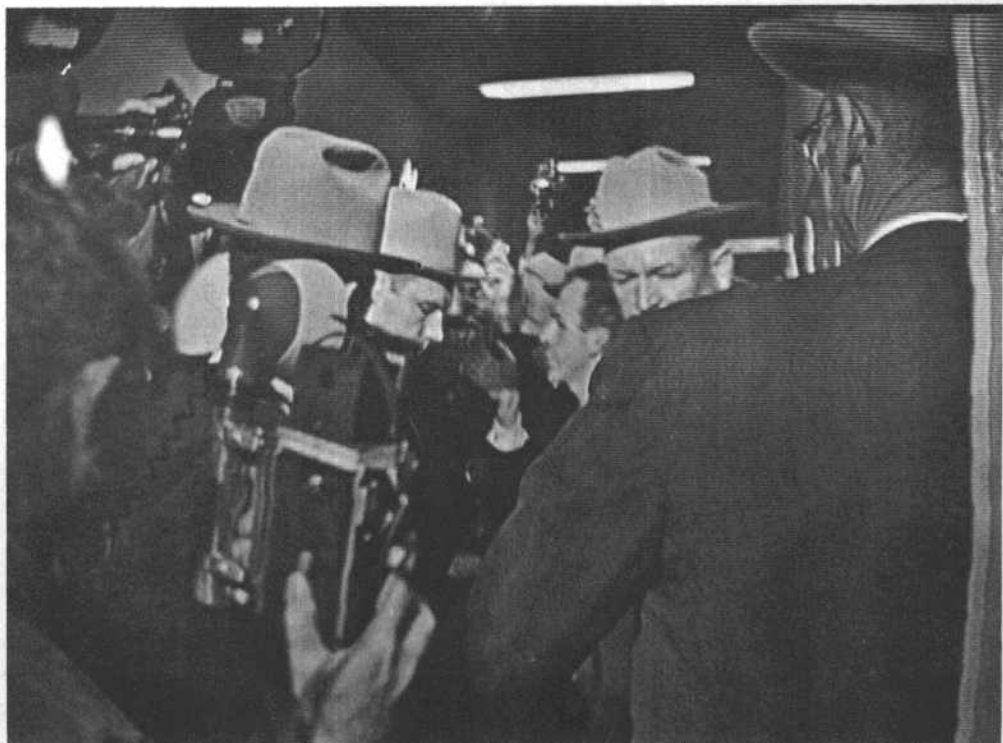
COMMISSION EXHIBIT No. 2631