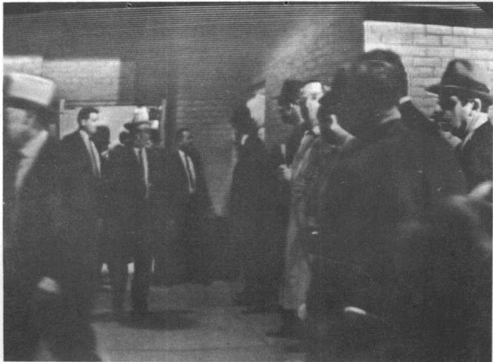
COMMISSION EXHIBIT No. 2635